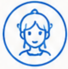
figure & anime shops

(GiGO, Taito Station, namco, Round1 — free entry, from ¥100/play, open to ~23:30)